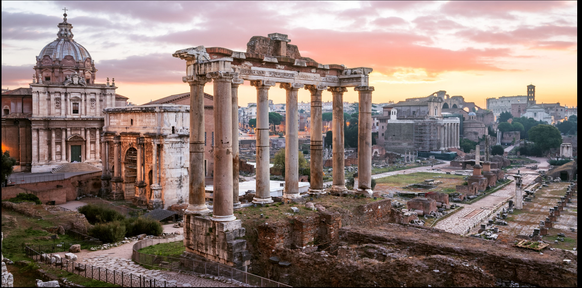
The Temple of Jupiter